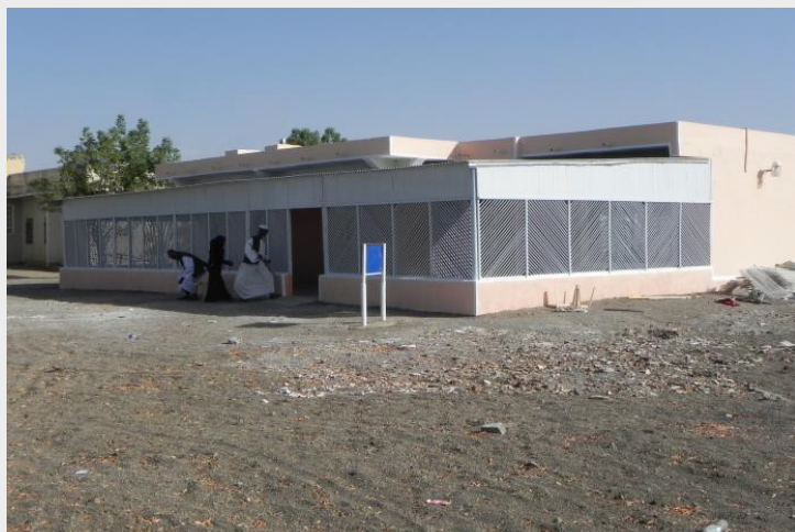
The health center in Umm Sheghera.