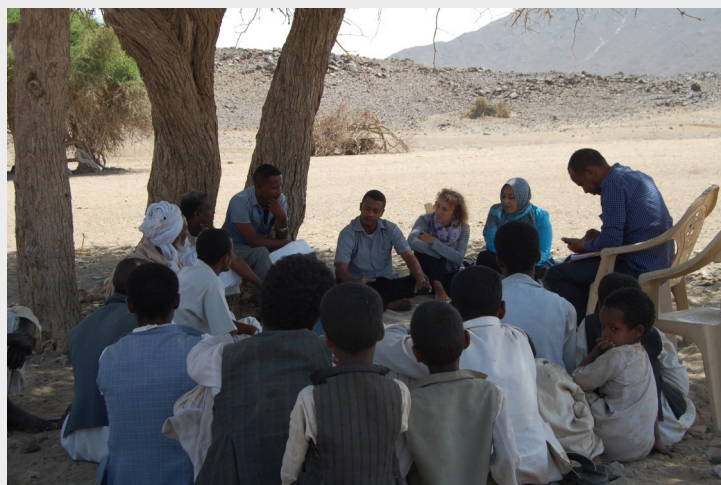
PQHS mission meet local leaders in Tomsai village.

They became aware of the system and understood the need to fulfill specific requirements in order to be accredited by the National Health Insurance.