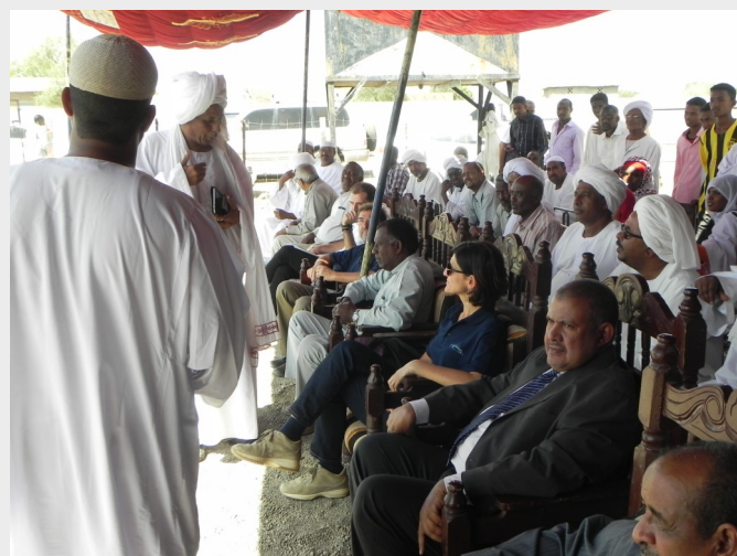
The Deputy Ambassador, Chiara Petracca, and the Minister of Health, H.E. Abdallah Bashir Haj Mousa, during celebrations in Umm Sheghera.

towards the main hospital in the city of Gedaref. Italian Cooperation refurbished and equipped the maternity block and constructed a block of latrines for patients. Now pregnant women can access health assistance in their own village while, before the intervention, they were forced to reach the main hospital in Gedaref to deliver their babies or in case of any obstetric emergency.