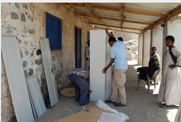
Installation of furniture at the Health Center in Tomsai village.

After the meetings, PQHS staff equipped these eight health centers with basic furniture to store the drugs and invited the local health assistants to participate in a training on drugs interaction, prescription and posology which was held at Sinkat hospital at the beginning of April.