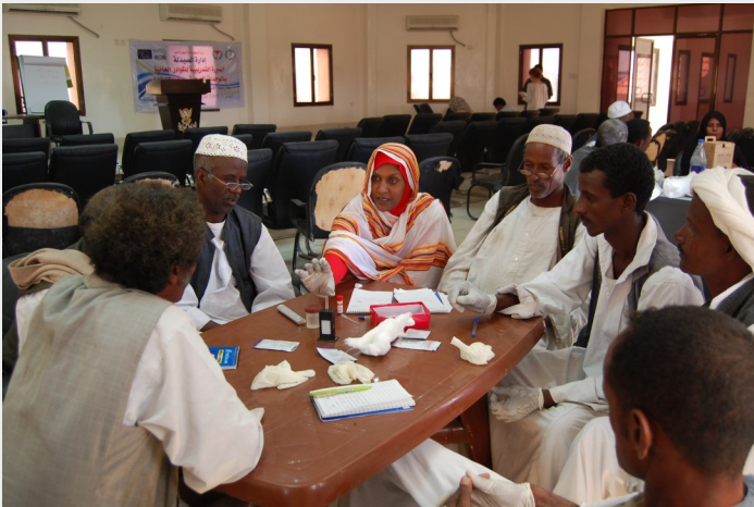
Sinkat hospital. Training of health assistants in drugs interaction, prescription and posology.