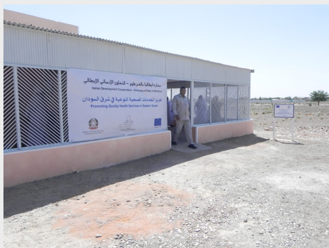
The main entrance of the maternity ward in Umm Sheghera.

Umm Sheghera's health center plays a strategic role in helping to moderate the flow of patients