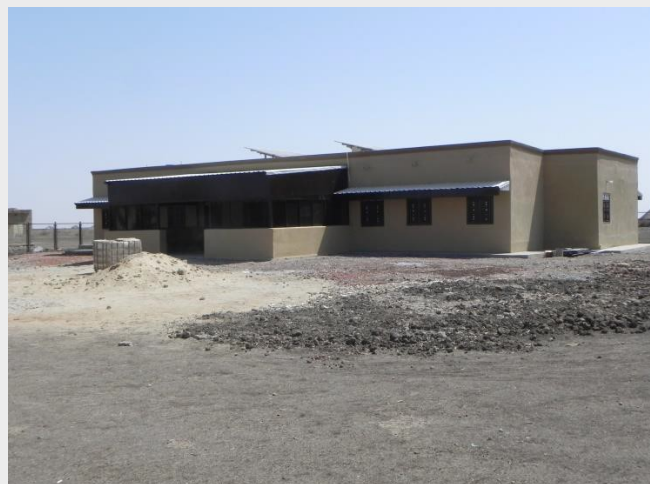
The health center in Maela.