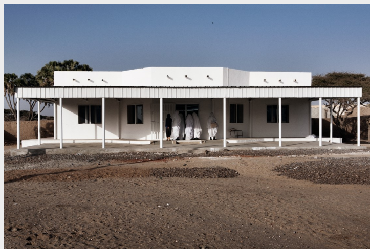
The newly rehabilitated maternity ward in Hamashkoreib.

We all were excited to reach the newly rehabilitated maternity ward for different reasons.