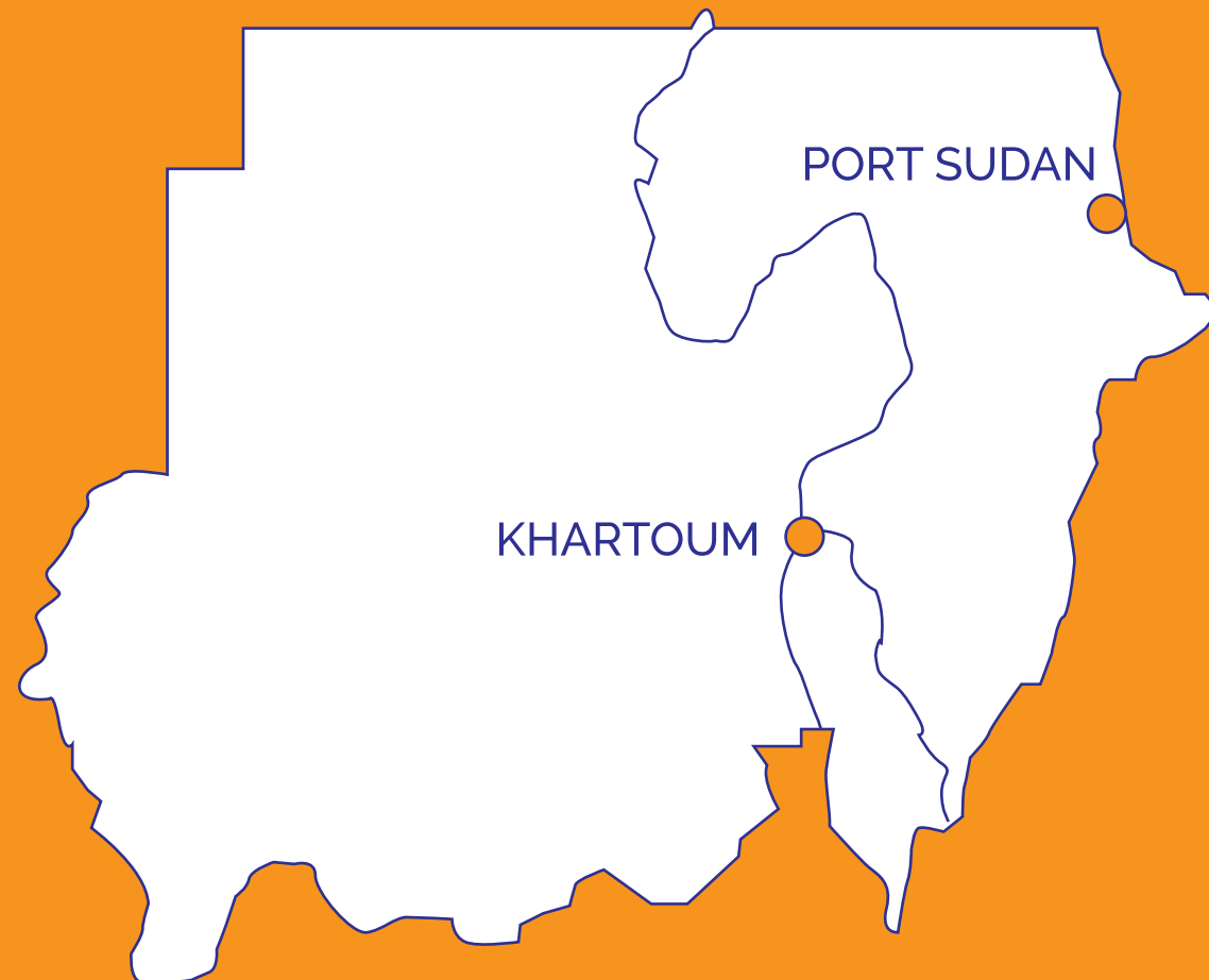
Khartoum & Red Sea States SUDAN

TADMEEN - Social inclusion, Human Capital Development and Protection of Vulnerable Groups within Migrants, Refugees and Host Communities