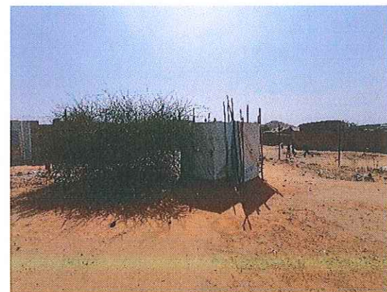
General Photo of The Alf 05 Health Center Of Al Salam (Nutrition program)