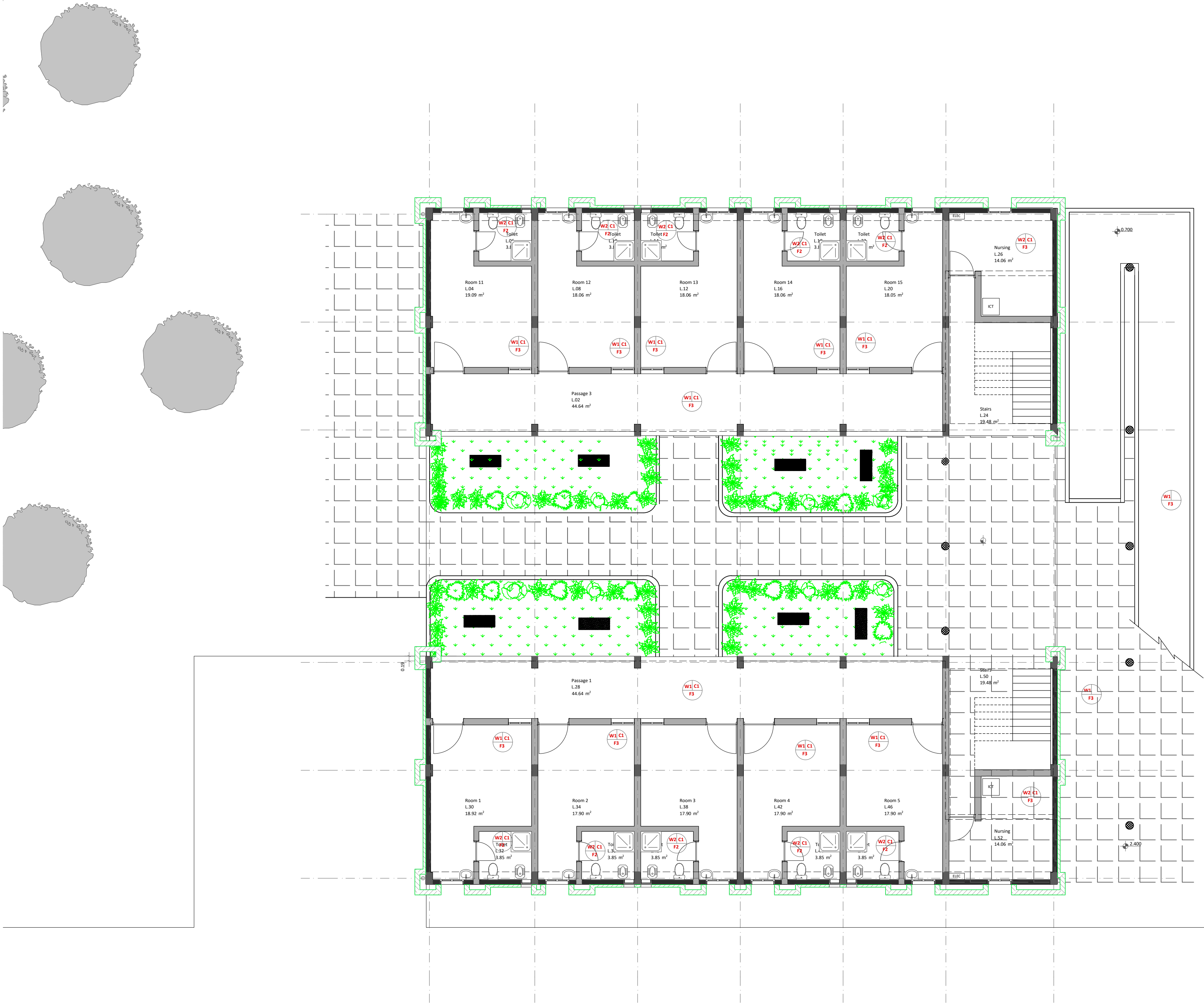
Ground Floor Finishing Plan