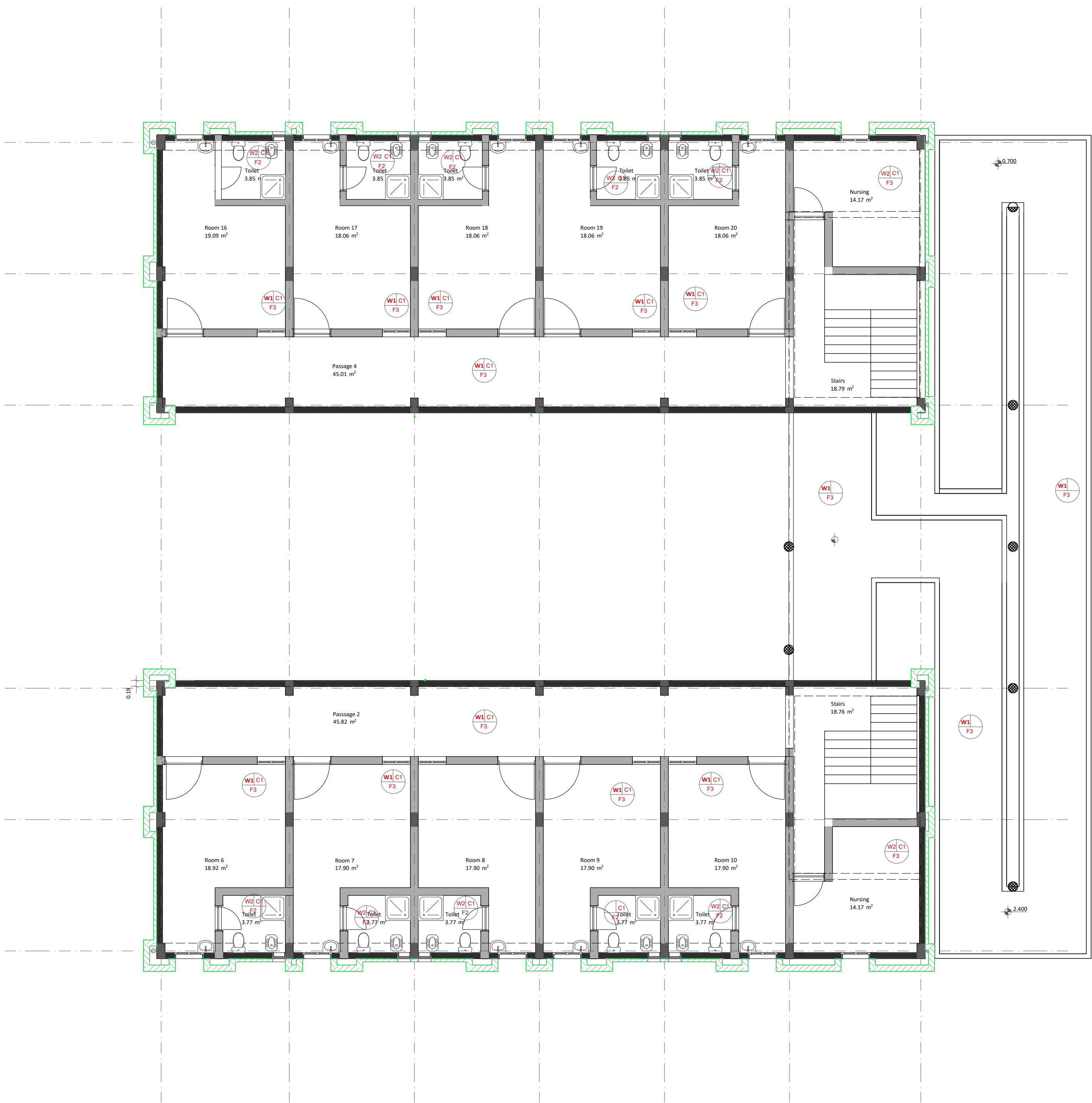
First Floor Finishing Plan

NOTES: All Dimensions are in Meters unless otherwise stated. All measurements to be verified on site. All levels to be verified on site.